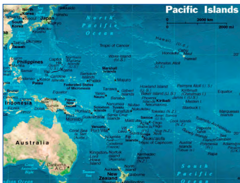
Figure 1: The Pacific Islands – small, isolated and widely scattered

Distance and flexible learning now offers a much quicker route to widen access to tertiary education. In addition, it may reduce gender inequality. Research on distance learners in the Pacific Islands has shown that women are more likely to get tertiary education if they can access distance learning, which allows them to stay with their families and often in their own countries.