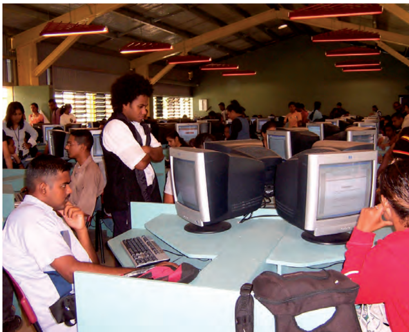
Computer labs are now a common and important element of tertiary education

While technology has been leveraged to make education more accessible and varied, it has not been fully integrated into the total learning system in many SIDS. This is a major challenge for educational institutions. They need to go beyond using technologies only to increase access, and more fully exploit them to enrich the range of educational experience of students; to develop better pedagogies; and to fundamentally alter both the economics of learning and the nature of pedagogy. This is the